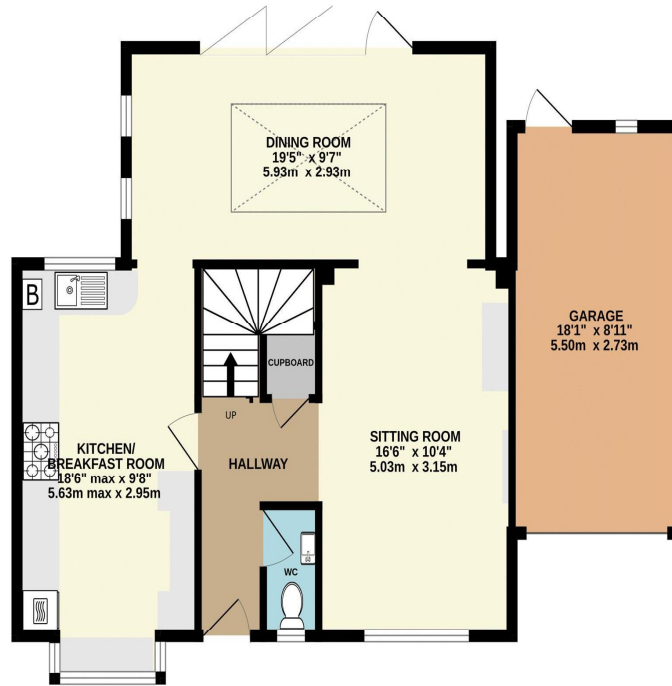
GROUND FLOOR 797 sq.ft. (74.1 sq.m.) approx.